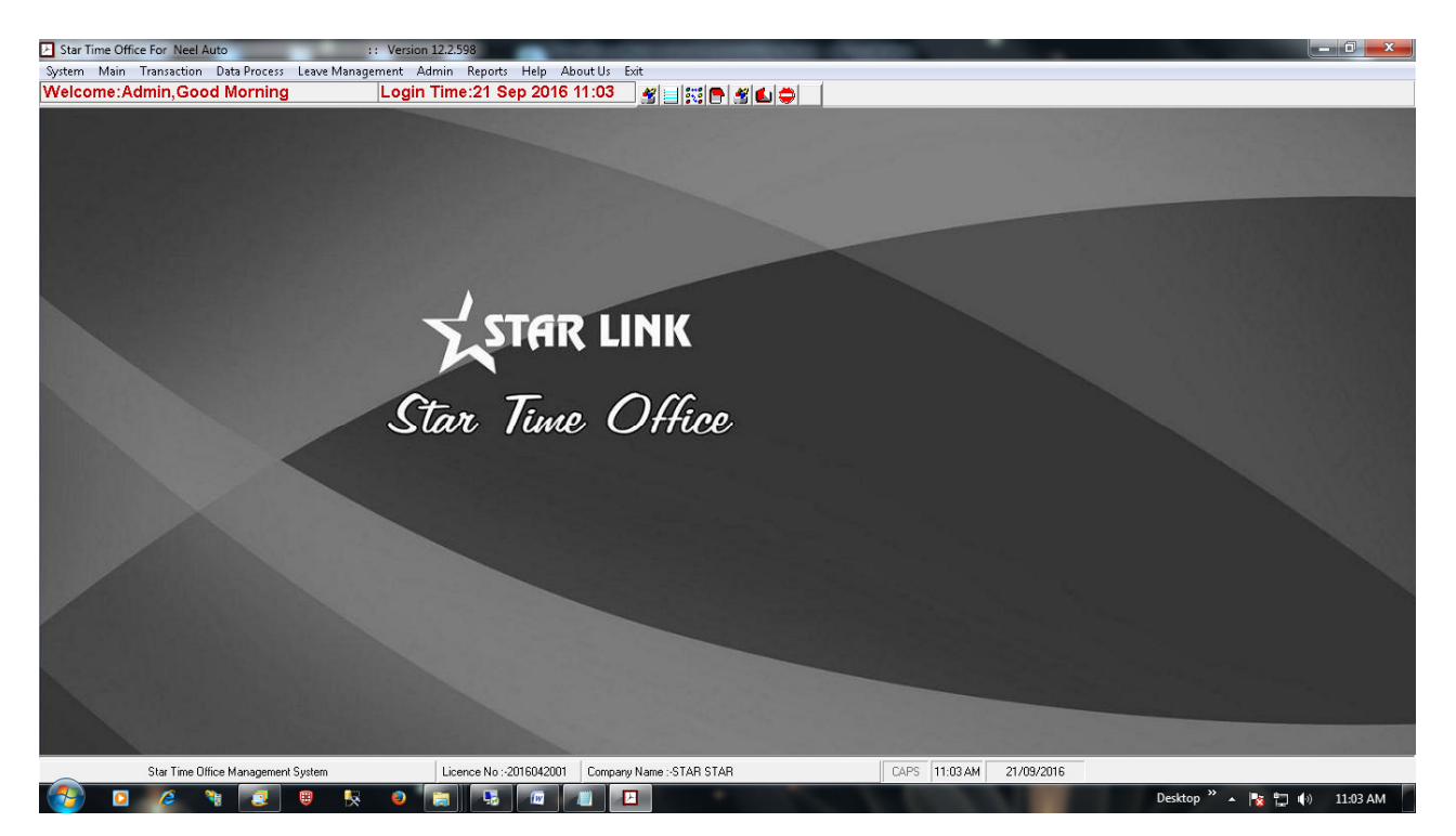
Figure 3: Main Screen for Time Office Software

Enter a user name and password that you can set for open time office software