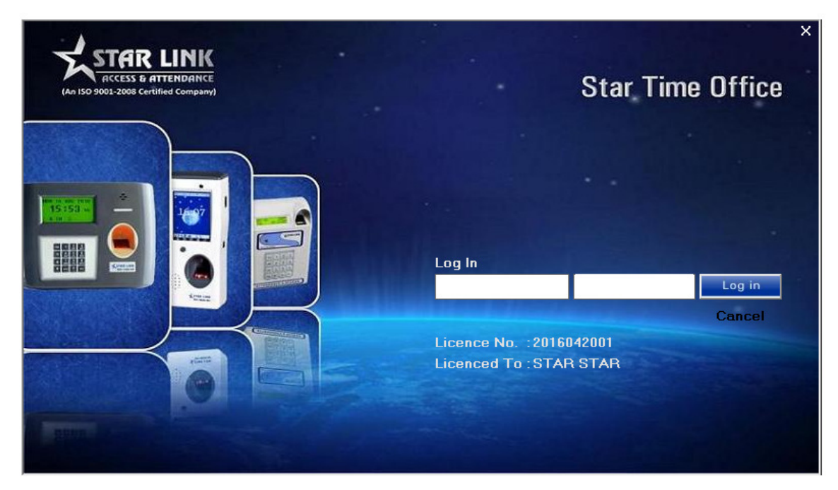
Figure 1: License window for time office software

After installing time office software, you just double click on star Time Office general and you will see license window and ask the valid user name and password like below: