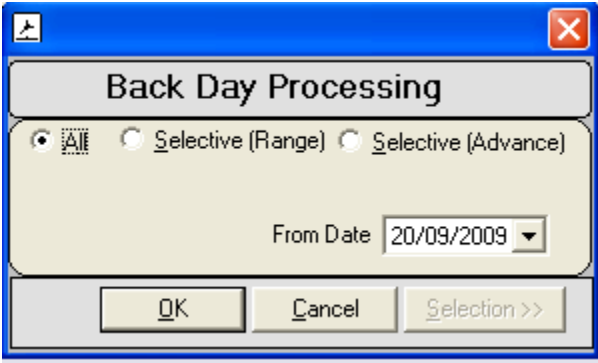
Figure 44: Back Date Processing

If you manually mark in attendance, overtime, shift change window then you have to run this process.