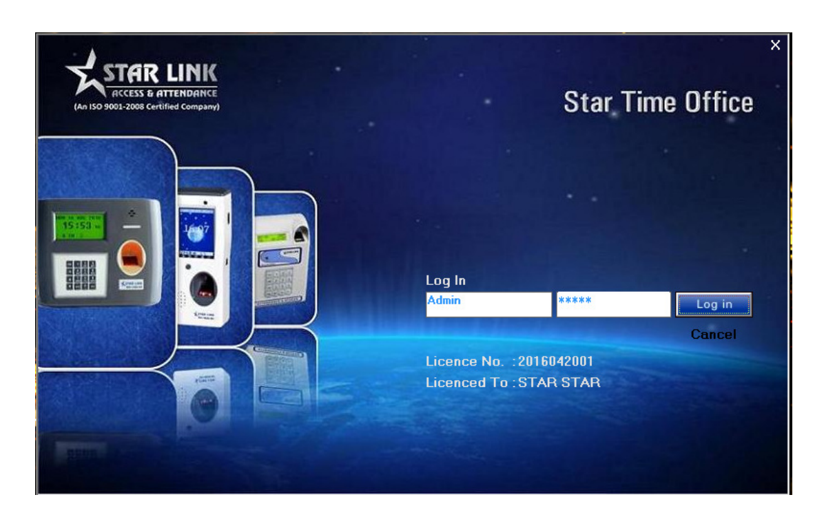
Figure 2: Set User Name and Password

Enter a user name and password that you can set for open time office software