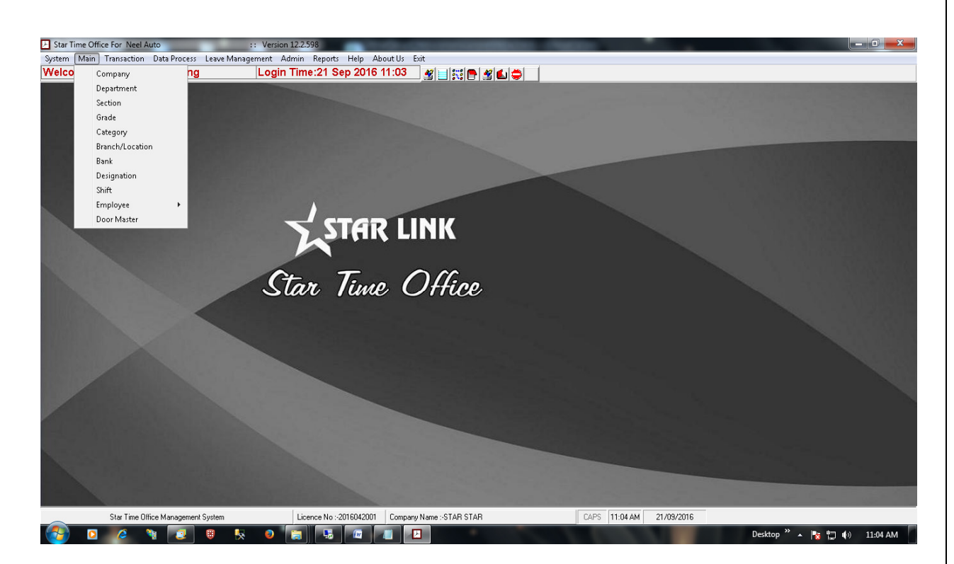
Figure 8: Main Master