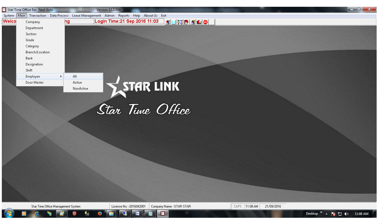
Figure 23: Employee Master-1